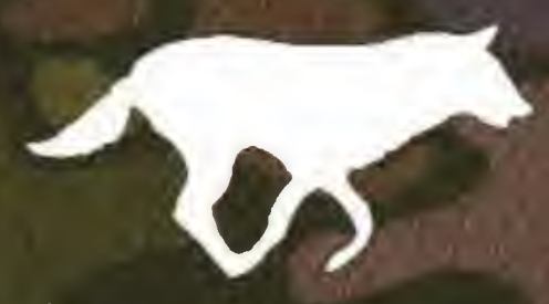
SHENT SOFTWARE INC